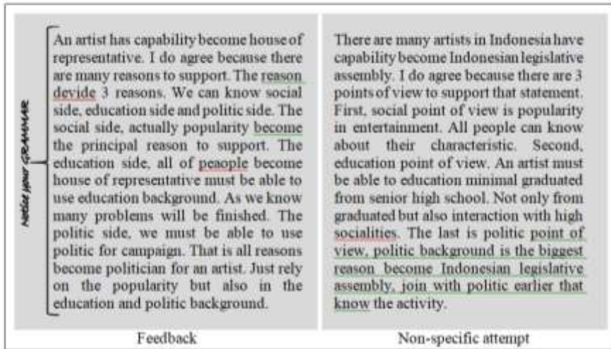
Figure 2 Non-specific attempt

As illustrated in Figure 1, three direct feedbacks were provided for the words ‘do not agree,’ ‘so,’ and the miss-typed word ‘meet.’ The two feedbacks provided for the words ‘do not agree’ and ‘meet’ were attempted; however, no attempt was found in feedback for the word ‘so.’ Figure 2 shows examples of non-specific attempts.