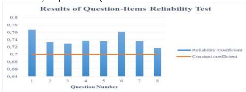
Figure 2 Results of question-items reliability test

The instrument is declared reliable if it has a reliability coefficient of 0.7 or greater. Thus, if the reliability coefficient is lower than 0.7, it is declared unreliable and vice versa. The reliability test result of the whole test items is 0.765. The results of question-items reliability test presented in Figure 2.