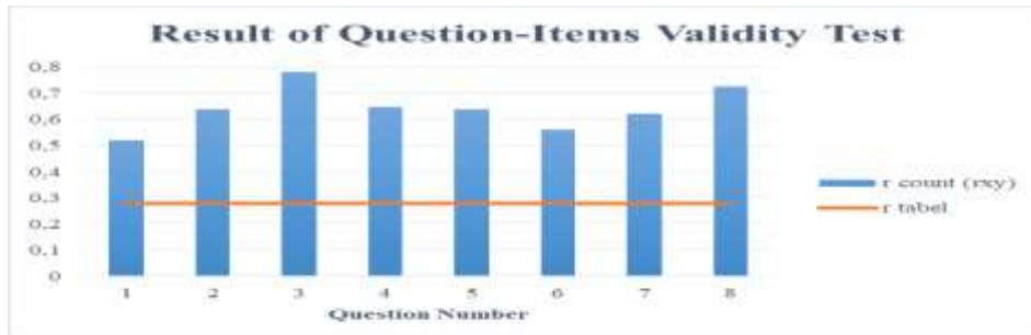
Figure 1 Results of question-items validity test

Based on Figure 1, the significance value of the instrument test validation is 5%, so all critical-thinking skills test items are valid. The item is declared valid if r count ( r_{xy} ) is greater than r table. Based on the table of product-moment values of Sugiyono (2011), with a significance level of 5% and the number of students ( N ) of 50, the r table value of 0.279 is obtained.