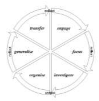
Picture 1 Phases of inquiry (adapted from: Marschall & French, 2018, p. 28)

from the preceding phase. In the last phase, students reflect the inquiry process, either individually or in a group. The above mentioned seven phases of inquiry were applied also to the lesson plans and worksheets used during the intervention described later in this study.