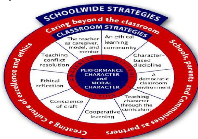
Figure 1 Schoolwide strategies

Value and character education with a comprehensive approach modeled by Lickona is carried out with educational strategies both inside and outside the classroom which are described in figure 1 (Pala, 2011):