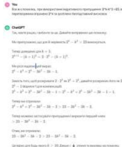
Figure 4 The reaction (2) of ChatGPT to pointing out its mistakes

Rephrase the prompt, indicating the mistake with even more precision "This does not fix the situation, the additive is lost 2^k , which exceeds the value of the trinomial 3k^2 + 3k + 1 at values k \geq 10 and allows to make a correct assessment». Specify the mistake in the prompt and get proof that is not complete but does not contain logical and factual mistakes (Figure 5). To complete the proof, it remains to show that for k \geq 10 , 2^k - 3k^2 - 3k - 1 > 0 . Note that the result of the proof of the same inequality proposed by ChatGPT after a month also contains mistakes (Prompt «Prove the inequality 2^n - n^3 > 23 for all-natural n \geq 10 », Figure 6). Despite the more detailed proof, ChatGPT makes the same mistakes in transformations.