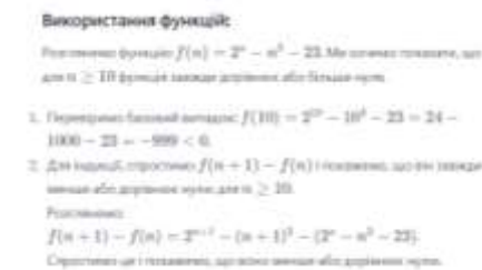
Figure 7 The method of using a function