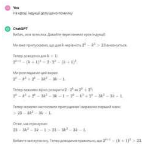
Figure 3 The reaction (1) of ChatGPT to pointing out its mistakes