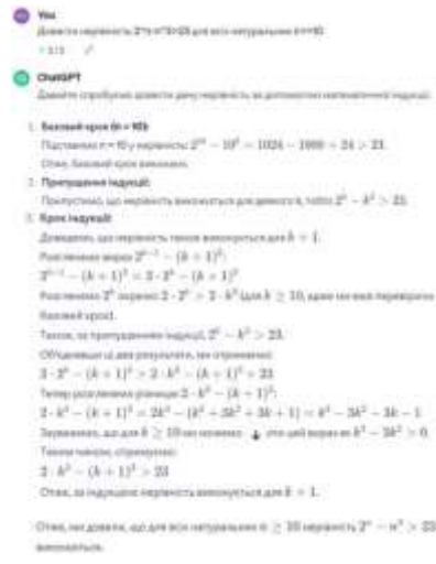
Figure 6 The result of the task solution after a month