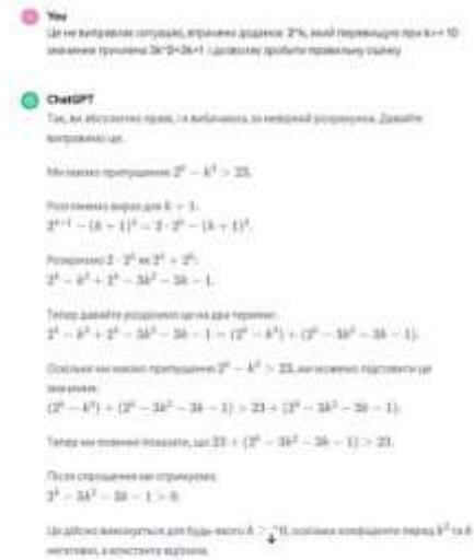
Figure 5 The reaction (3) ChatGPT to mistake correction

Another method suggested by ChatGPT (Method of using function analysis, Figure 8) also has several drawbacks – it provides general recommendations for proving inequalities using the monotonicity of functions without specifying how to implement it in this particular case.