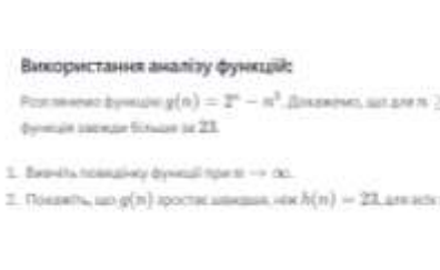
Figure 8 Method of Using Function Analysis

When using the method of differentiation (Figure 9), ChatGPT applies the assumption of induction, incorrectly finds the derivative, and uses the differentiation of inequality, which is generally incorrect.