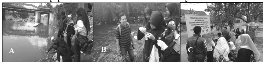
a. Location 1: 7^{\circ}.54'48.25''S , b. Location 2: 7^{\circ}.59'15.86''S , c. Location 3: 8^{\circ}.00'37.62''S Picture 1

The investigation was conducted by collecting physical data on water quality and environmental social data around the location of the investigation. Physical data on water quality were measurements of water discharge, temperature, color, and mineral content dissolved in water, while social data were population demographic data, household waste management and river water utilization by residents. The data obtained was then collected, described and sought for its correlation by conducting discussions with the teacher. The final results of the report were then presented in front of the class so that there was a correlation between the quality of water in each location and the activities of the population around the location of the investigation.